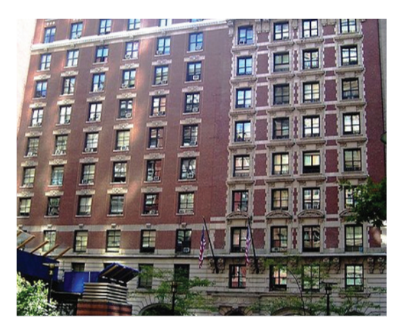
Special needs housing in New York, NY

The outcome of this effort has been impressive: residents spend 50 percent fewer days per year in psychiatric hospitals, make 58 percent fewer visits to emergency rooms, and are four times less likely to face medical issues.