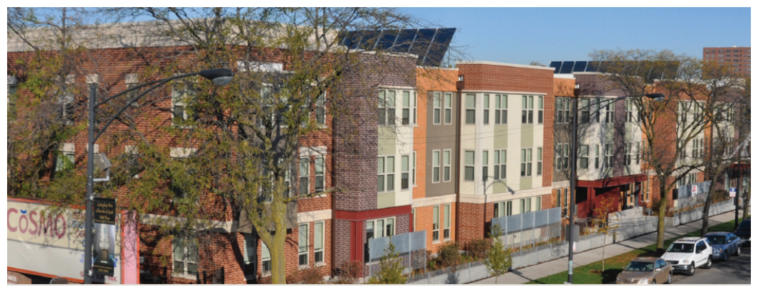
Affordable housing on Chicago's South Side

Affordable senior housing is most often government program-supported, is limited to those who meet income qualifications and often has extremely long waiting lists.