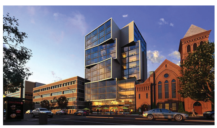
Veterans housing in Washington, DC

The HUD-Veterans Affairs Supportive Housing (HUD-VASH) program combines Housing Choice Voucher (HCV) rental assistance for homeless veterans with case management and clinical services provided by the Department of Veterans Affairs (VA). VA provides these services for participating veterans of all ages at VA medical centers (VAMCs) and community-based outreach clinics.