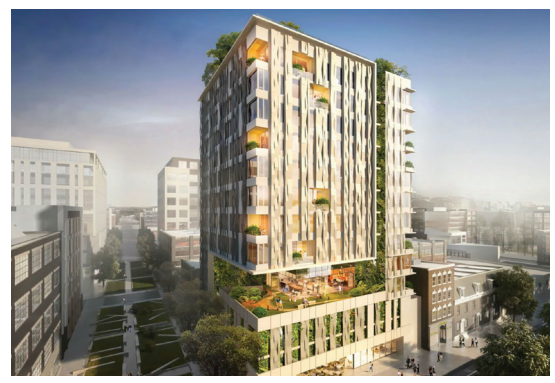
Multifamily housing in Portland, Oregon

Living in an apartment in a multifamily building immediately solves the most common problem of aging—steps. Almost all units are single-level.