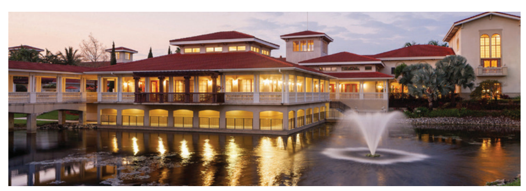
CCRC in Palm Beach Gardens, FL

CCRCs are the high end of senior living options both in services provided and costs.